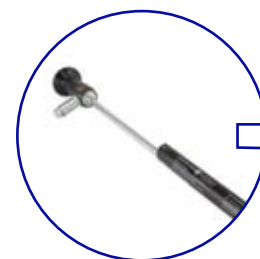
Lap Scope WarmOR™

The Scope HelpOR™ reduces the need to cleanse the scope lens throughout the surgery, which results in improved visibility, less surgical interruption, and therefore fewer procedure delays.