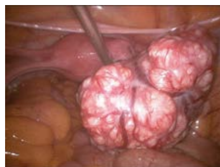
With Scope HelpOR™ - Clear surgical view